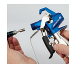
Install New Cartridge